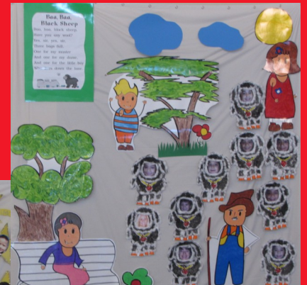
Baa Baa Black Sheep