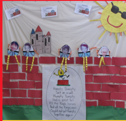
Humpty Dumpty Sat on a Wall